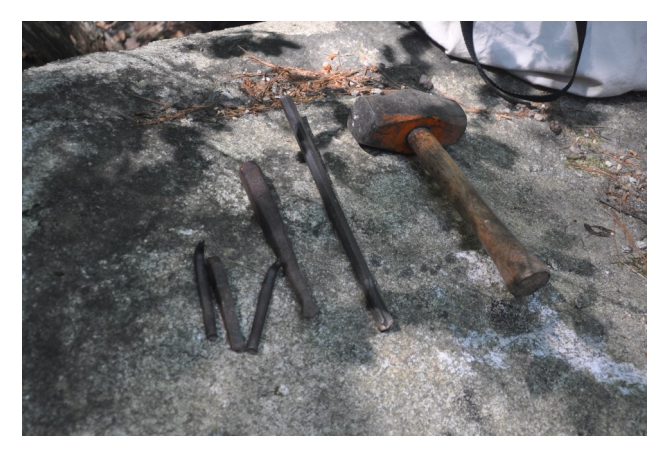
Tools of the trade