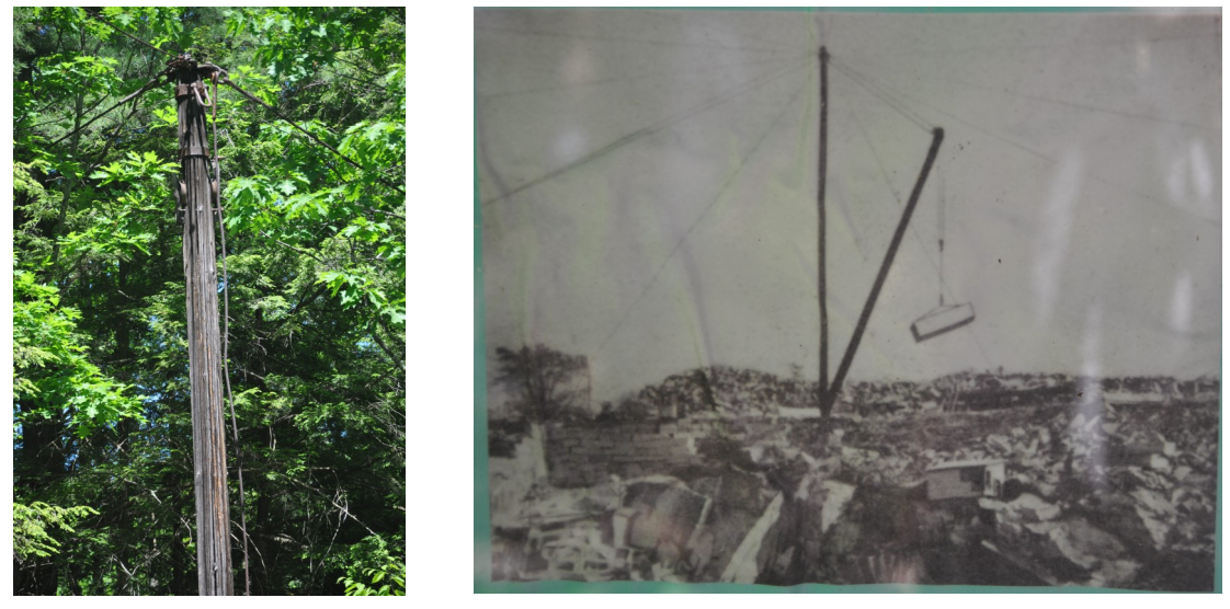
The remains of the derrick (left) used to lift the cut granite and what it looked like in operation (above) with the boom (no longer present) attached.

James Gage providing some details about the construction of the shaping shed, built out of some of the left over granite blocks from the four onsite quarries.