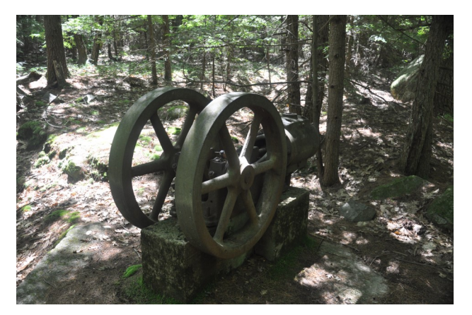
The air compressor used to drill holes in the granite